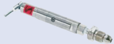
Example of a Valve Freeze Test Apparatus

These tests, however, are not completely controlled and are not always repeatable. Also, their pass/fail nature does not offer enough information to allow a decision on how much methanol to add. Thus, alternative water content tests must be developed.