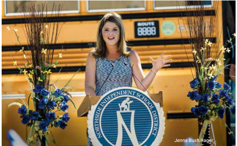
Jenna Bush Hager

The Council's growing investment in the development of new propane-fueled products has made it an incubator of technology that helps Americans save money and cut emissions while contributing to the nation's energy security.